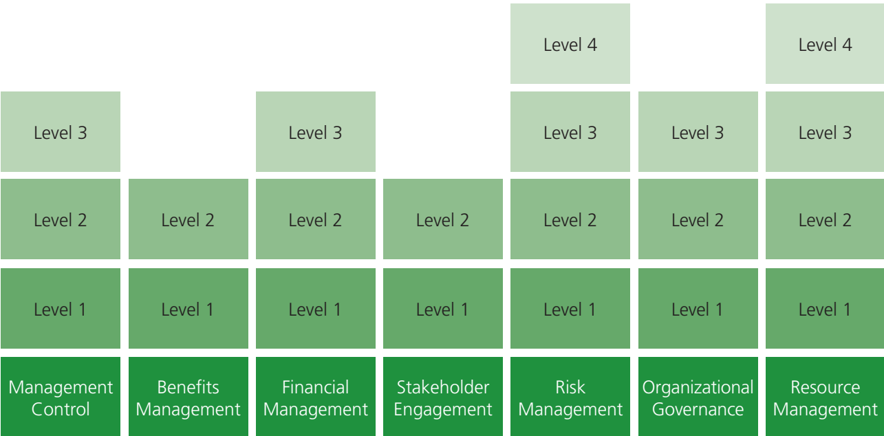
Figure 2 – Example assessment of Process Perspectives

Most organizations have strengths in some areas but not in others. P3M3 is designed to acknowledge these strengths as well as highlighting weaknesses. Figure 2 illustrates how an organization might be viewed from the Process Perspectives.